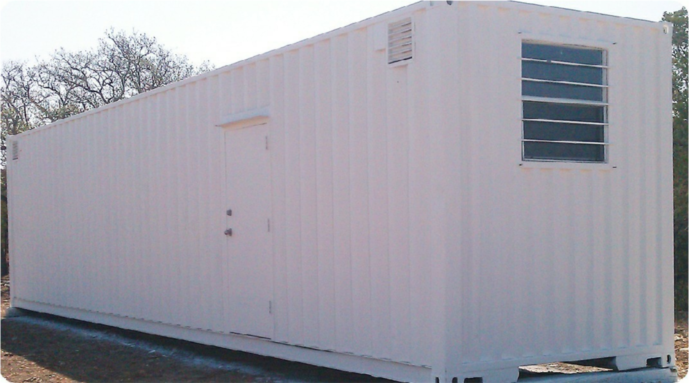
This Modular Container is coated with Thermo-Shield Roof Coat, a true Energy Saver!

Thermo-Shield® Roof Coats are highly efficient, energy-saving, flexible coatings, made from a water-based pure acrylic resin system filled with hollow sodium borosilicate glass micro spheres. Each micro sphere acts as a sealed cell and the entire mastic acts as a thermally efficient blanket covering the entire structure. These coatings are non-toxic, friendly to the environment and form a monolithic (seamless) membrane that bridges hairline cracks. They are completely washable and resist many harsh chemicals. Thermo-Shield® Roof Coats have high reflectance and high emittance as well as a very low conductivity value. Thermo-Shield® Roof Coats greatly reduce thermal shock and heat penetration by keeping roof surfaces much cooler in hot summer weather. They offer UV protection and low VOC's.